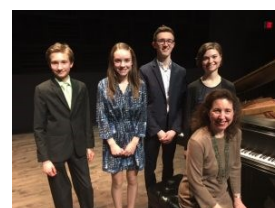
Students at Masterclass with Angela Hewitt on March 24, 2017.